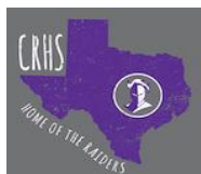
Raider TX Tee